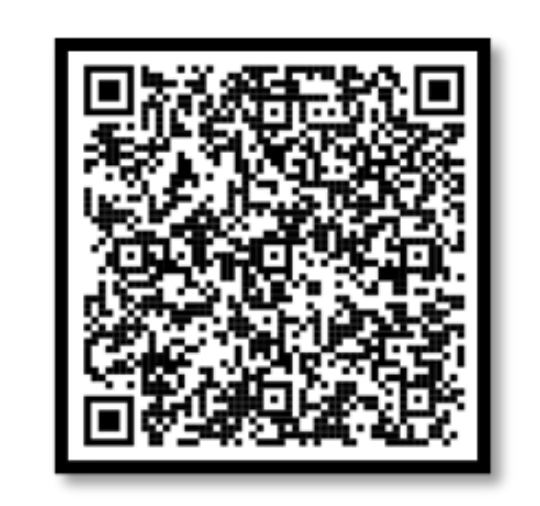
Scan QR code to learn more about MSU Extension's Fair & Festival Assessment