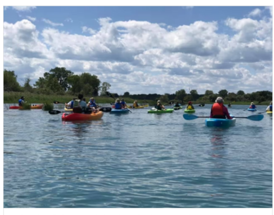
Friends of the St. Clair River looks to revive MI Paddle Stewards program

We had 13 people attend the training which was for people who want to train members of the public. The training focuses on learning to identify aquatic invasive species.